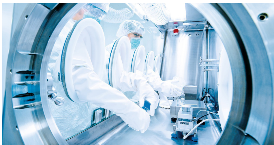
Lonza's services and products include active pharmaceutical ingredients and stem-cell therapies.