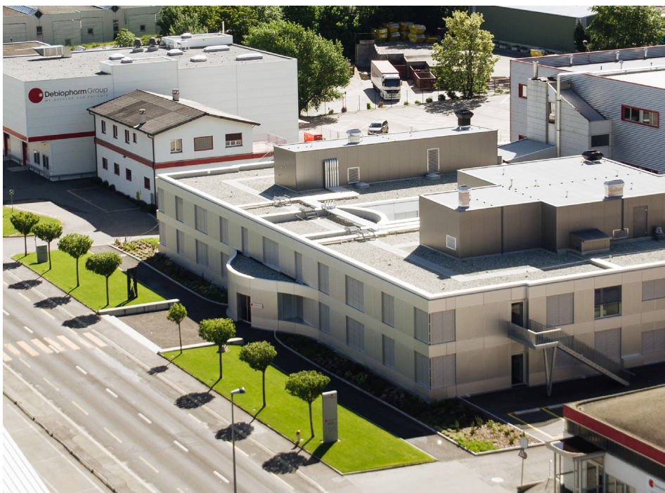
The Debiopharm site in Martigny.