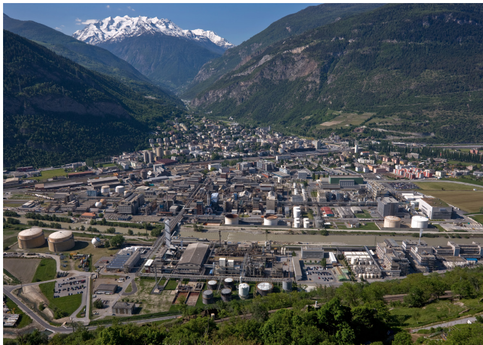
The plant in Visp is Lonza's largest site.