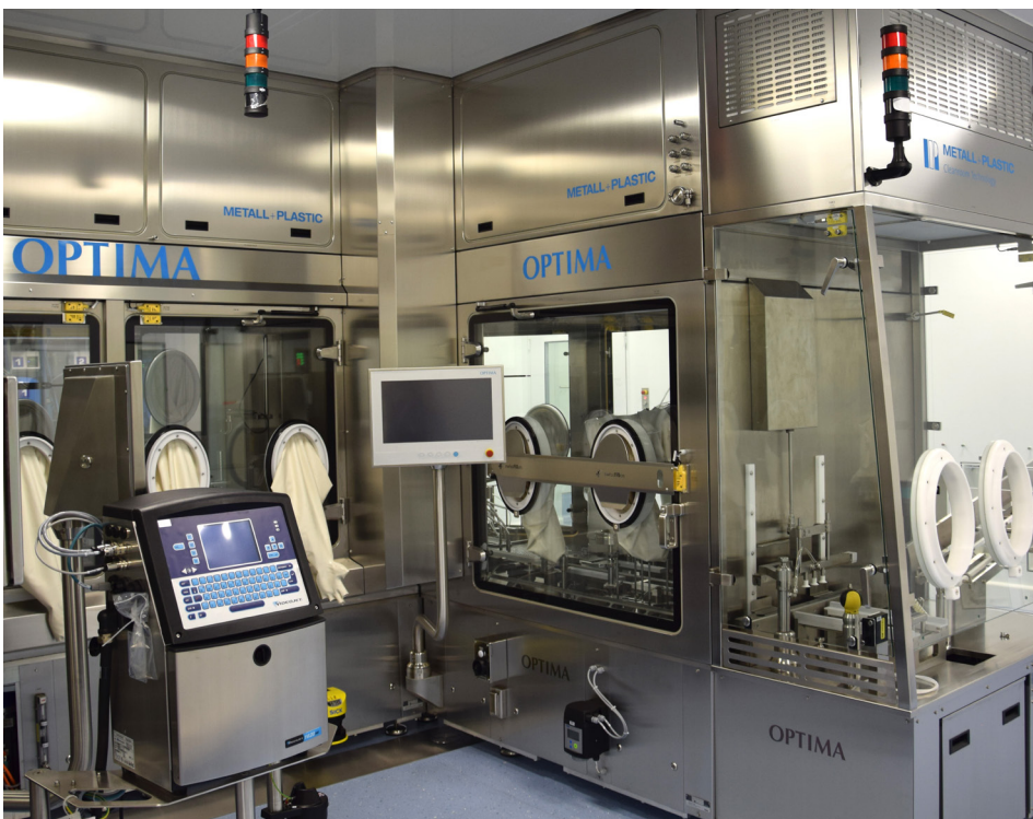
swissfillon's filling line is innovative, fully automated and highly flexible.