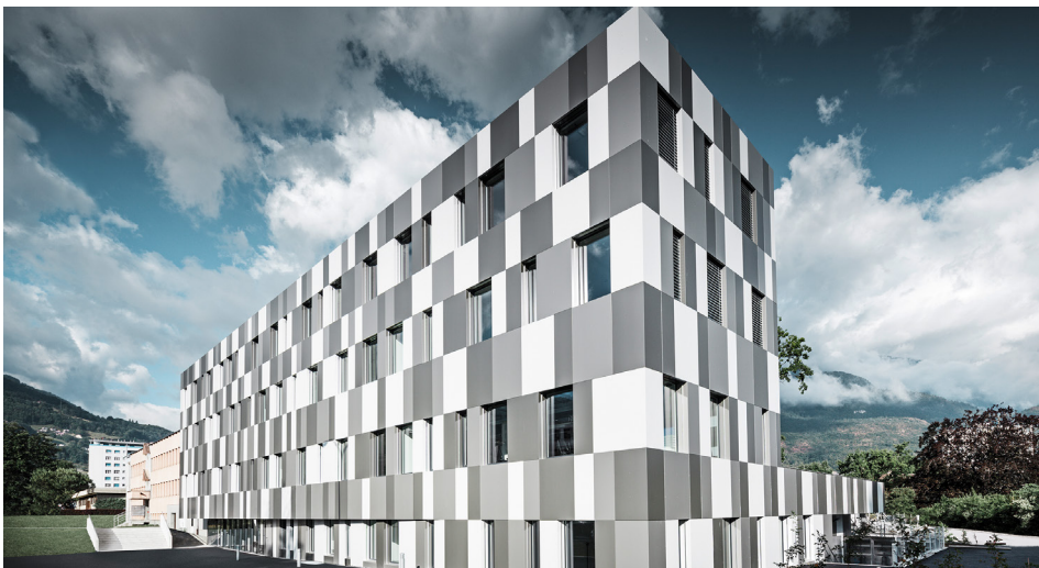
BioArk in Monthey.